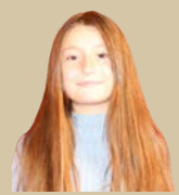
Written By Sofia Rolfe PERFORM Council President